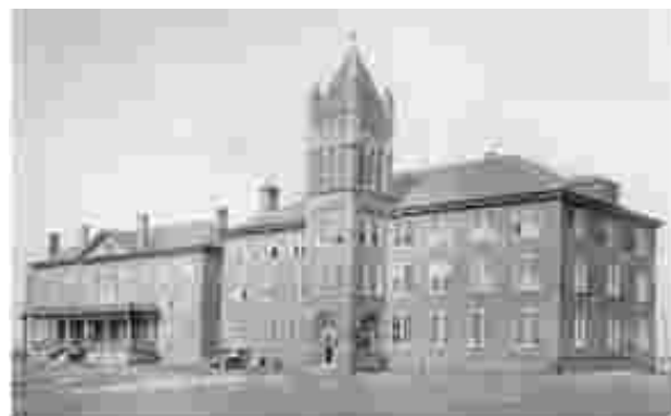
Lander College building, 1904-05

Lander offers high-demand and market-driven programs to ambitious and talented students in and around South Carolina. These programs are delivered in a rich liberal arts environment to produce highly qualified and marketable graduates. This is accomplished by creating graduates who are well rounded and prepared to continue their education or launch their careers.