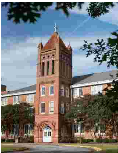
Lander Bell Tower 2020

Lander University was founded in 1872 and on July 1, 1973, became a state-supported higher education institution incorporated by an act of the South Carolina General Assembly and signed into law by then Governor John C. West.